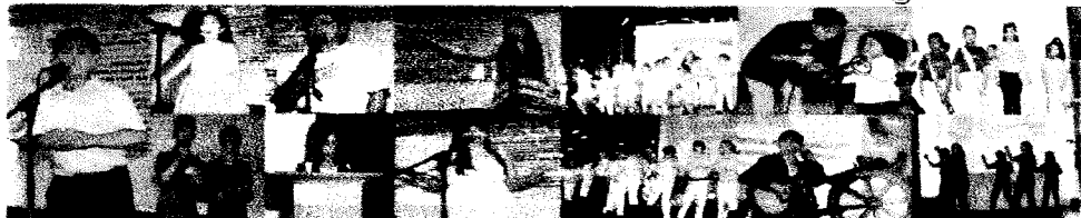
ORATION, DECLAMATION, EXTEMPORANEOUS/IMPROMPTU and EMCEE-ING